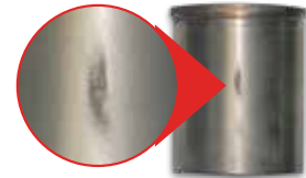
Cylinder liner showing pitting damage, meets current industry standard for corrosion protection.